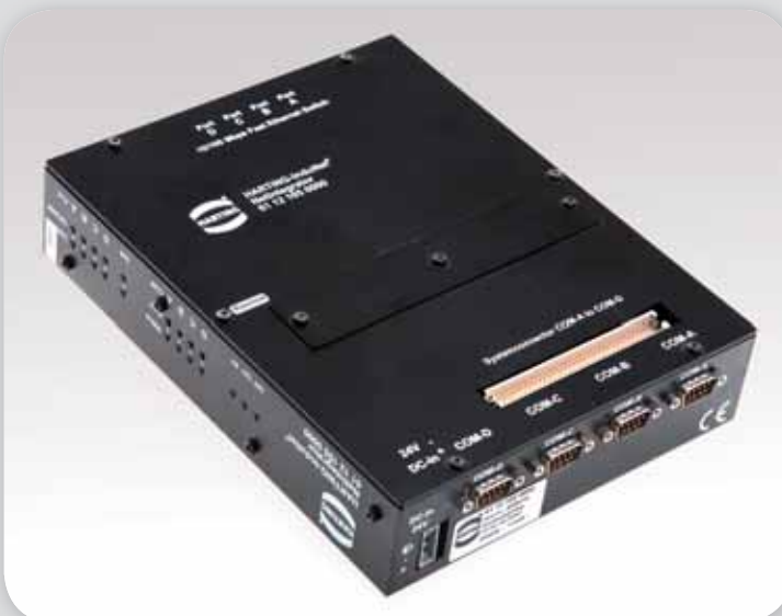
Decentralized electronic module with high degree of protection (IP 65 / IP 67)