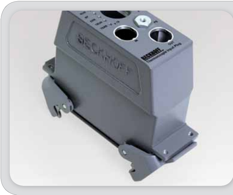
Customized connector concept

HARTING provides a convincing answer to each and every connectivity requirement – whether board-to-board, cable-to-board or wire-to-board applications. Our customers benefit from our capability of providing tailored solutions for all applications.